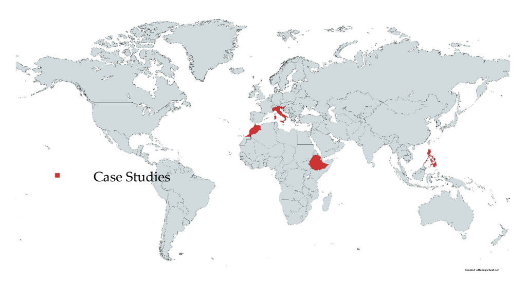
Figure 1. Case studies of the Special Issue were from few countries but well spatially sorted.