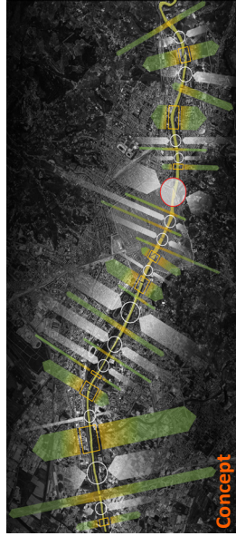
Figure 1 (a sinistra) Vista dal fiume Arno verso l'area di progetto. Figure 2: (in alto e in basso) Schemi concettuali per il sistema Ecomuseo dell'Arno.