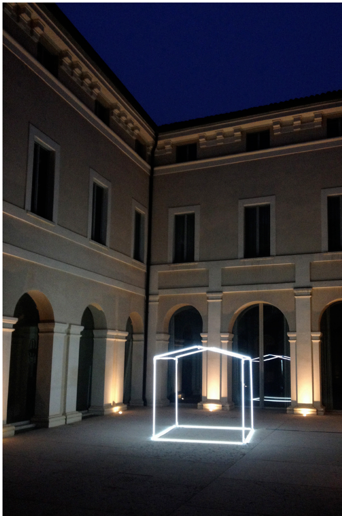
Fig. 4 Massimo Uberti. (2018). Abitare. Palazzo Beccaguti, Mantua. Courtesy of Massimo Uberti.