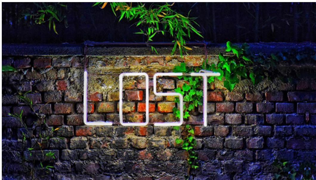
Fig. 1 Massimo Uberti. (2020). LOST [neon and converters]. Naviglio della Martesana, Milan.