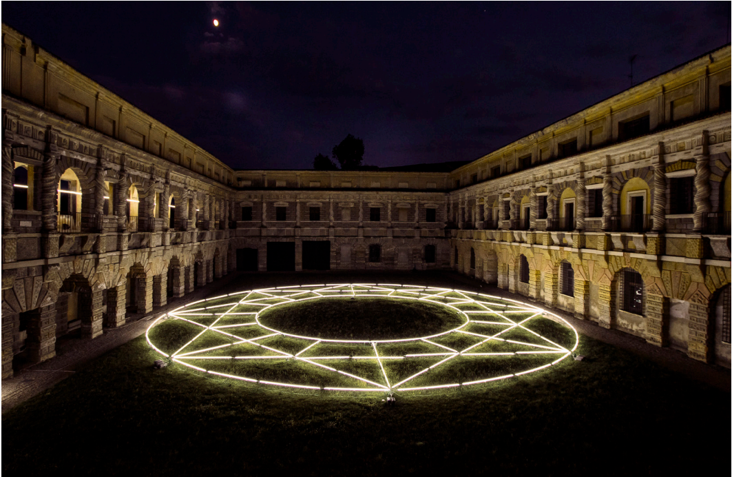
Fig. 7 Massimo Uberti. (2018). Città Ideale [neon and converters]. Palazzo Ducale, Mantua.

extension of man in the external world accessible most of the time by an image that becomes an interface (Puma, 2019a). On the other hand, in this substantial continuity between the person and the environment, the need for humanization and personalization of the virtual proxemics emerges, expressed by the so-called affective computer science which for some time has committed many efforts in the direction of the 'animation' of objects, starting with robots, and the activation and involvement of emotions in technology.