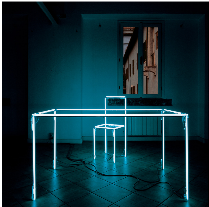
Fig. 2 Massimo Uberti. (2000). Scrittoio [neon and converters]. Courtesy of Massimo Uberti.

It is common and widespread empirical data, as well as shared scientific opinion, that the subjective perception and experience of time also depend on the type of activity that an individual performs –time seems to accelerate when we are involved in stimulating and pleasant activities– and that emotions affect on our experience of time, which is altered in both senses –it may seem accelerated when we are in fearful situations or slowed down in unpleasant or problematic ones– therefore, like the sensory one, our perception of time is also not truthful, but it is modulated by changes in