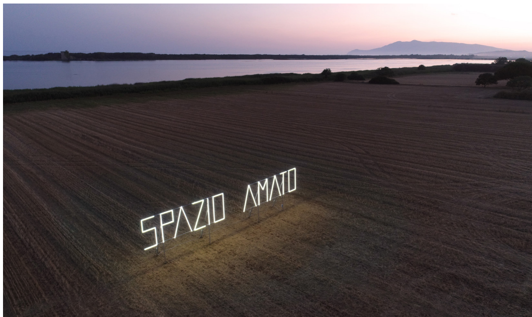
Fig. 8 Massimo Uberti. (2020). Spazio Amato [neon and converter]. WWF Oasi, Lago di Burano.