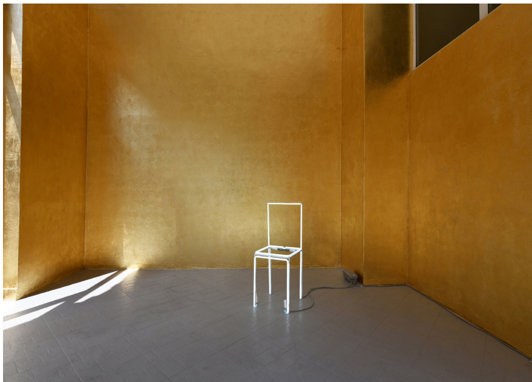
Fig. 6 Massimo Uberti. (2019). Loved space [neon and converters]. Milan.

On the one hand the sudden and totalizing projection in the virtual world lived in the period of observation has limited and mortified the individual and collective physicality in public places, but it has also condensed on itself a resilient response heavily entrusted to technology, which has also found a glue in the mixed and pervasive onlife of the infosphere and has made it possible to cushion the absence of the body and better manage the forced passage from monochronic to polychronic time.