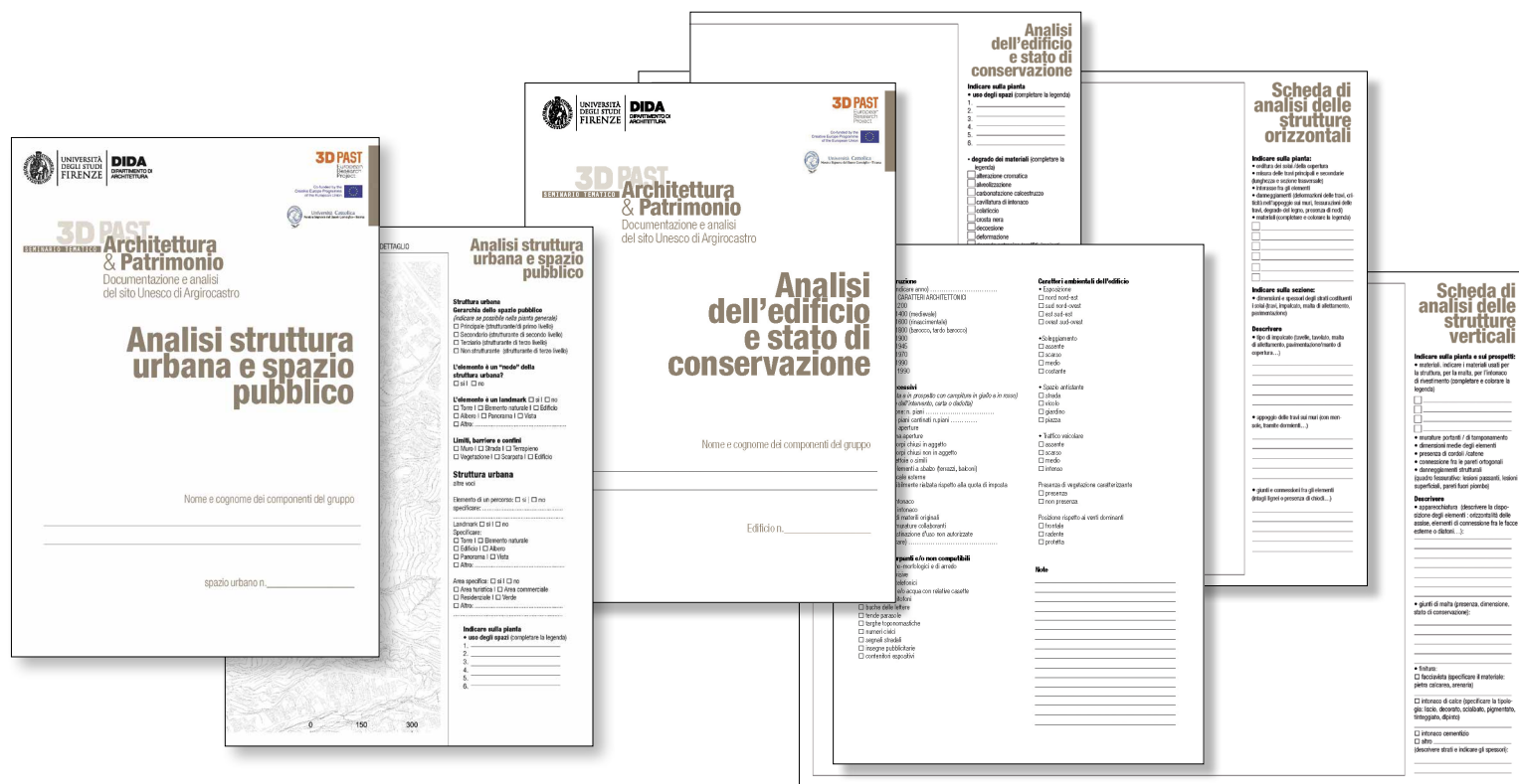
↑ Survey data sheet used in Gjirokastra, Albania

the social and the private domain, are all effects of architectural expression of high ethnographic significance.