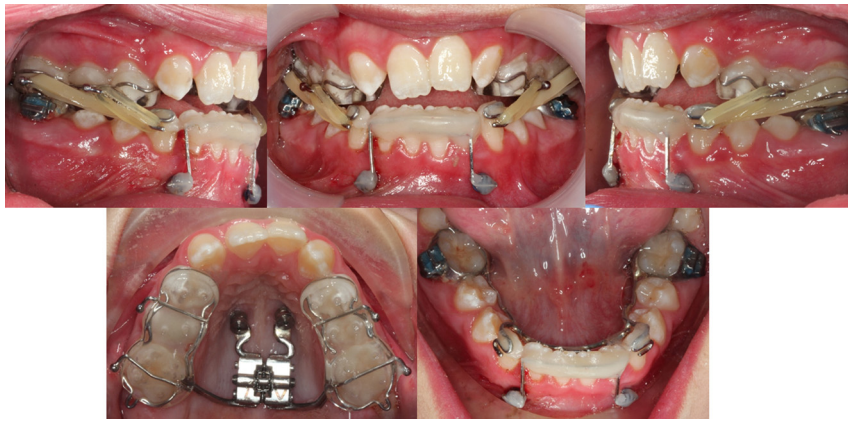
FIGURE 1 Intraoral photos of the appliances in situ for the alt-RAMEC, hybrid-Hyrax (HH), lower-lingual-arch (LLA) group

attachment of each implant's transfer-copying for the polyvinylsiloxane (PVS) impressions. Their sagittal position was between the first and second premolars. The LLA was cemented with bands on the first permanent mandibular molars and included "S" shape hooks bonded with composite resin to the permanent canines and wire extensions to the lingual surface of the incisors to prevent their retroclination. Two self-drilling Aarhus® miniscrews were inserted between the mandibular canines and lateral incisors, in attached gingiva in the area of the mucogingival junction and hosted two sectional 0.019 × 0.025 stainless steel wires bonded passively with composite resin to the lower incisors aiming to reinforce anchorage and maintain them in their initial position (figure 1). All TADs were inserted under local infiltration anaesthesia (2% lidocaine with 1:80.000 epinephrine). The alt-RAMEC protocol included expansion and constriction of 1 mm/day in a weekly interchangeable manner for a total of 8 weeks and an additional 1 week of expansion. Upon completion of alt-RAMEC, full-time heavy Class III elastic forces of 400gr were applied from the HH ball hooks to the LLA "S" hooks for 8-9 weeks [27]. Immediately