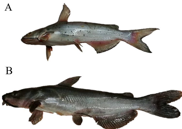
Fig 2. Comparison between a specimen of Ictalurus punctatus after A) 96 hours of cooling and B) 96 hours of freezing