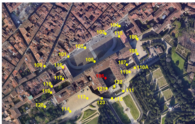
Figure 1 – Map of the reference network's points.

This result can be obtained by using, within the Italian territory, the ITALGEO2005 national geoid model, created by the Polytechnic of Milan and published by the Military Geographical Institute, which is characterized by a mean square error of 3.5 cm.