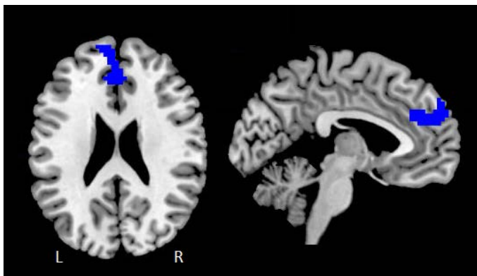
Figure 3: Regions in which functional connectivity in the anterior default mode network correlated negatively with self-reports of depth of hypnosis.