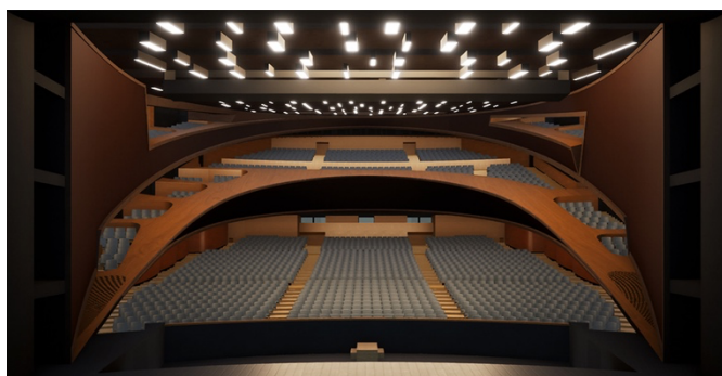
Figure 5 – Virtualization of the Teatro del Maggio Musicale Fiorentino

collaborating specialists who can interact within virtual workspaces and immersive multimedia systems, starting to investigate the possibilities of using the data produced as valuable tools for dissemination and communication and entertainment. By integrating auralization and a reliable and realistic visual experience based on data acquired through integrated TLS digital survey and Structure from Motion (SfM) photogrammetric techniques, it is possible to investigate the mutual influence that visual and acoustic stimuli have on the perception of the virtual experience. These outputs will allow the user to experience, through Virtual Reality applications, a perceptually multisensory experience, associating an immersive visual representation with an acoustic simulation.