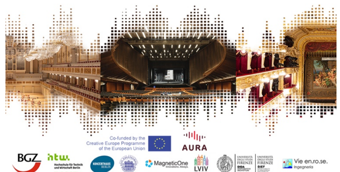
Figure 1 – The three case studies of the AURA project and its partnership

Studying the three case studies at the European level made it possible to develop an appropriate methodology dedicated to digitalization and virtual reconstruction. These processes aim to obtain reliable assets to set the subsequent auralization processes and develop multisensory 3D models, reliable and performing both in terms of graphic rendering and virtual use and in terms of acoustics.