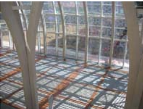
Fig1.,2 Main Atrium with glass-glass PV panels