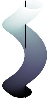
FIGURE 1. A portrait in \mathbb{C} \times \mathbb{R} of a section of \mathcal{W} . The first variable z_1 spans in the horizontal plane \mathbb{C} , while \log|z_2|^2 spans along the vertical line \mathbb{R} (drawn in black).