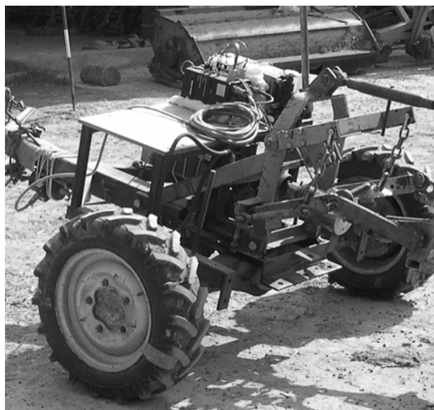
Fig. 1 - The tested hitch-cart.

The preliminary traction tests were performed using a single-furrow plough drawn by two horses (5 and 8 years old), of T.P.R. (Tiro Pesante Rapido, Fast Heavy Draught Horse) breed, weighing approximately 700daN. Five tests were carried out, each one ploughing a furrow 20cm deep by 25cm wide and 50m long. Draft was measured using a BLH strain gauge (model U3G1, Vishay Measurements Group GmbH, Germany) load cell (response: 3mV/V; F.S.: 50kN). The output of the load cell was connected with a data acquisition system based on a modular multi-channel data logger (MCDR-M-128, Leane international, Italy) fitted to a laptop computer (MCDR128 acquisition software). The measuring system was calibrated before every test to avoid any possibility of error attributable to jerks. The same instrumentation was used for the hitch cart tests. In this case the two ends of the load cell were mounted through articulated eye joints between the hitch cart front bar and the rear hitch of a tractor. The tested hitch cart (Figure 1) is made up of an axle equipped with a differential gear box; on the axle a trapezoidal shaped chassis made with iron square section tubes was mounted.