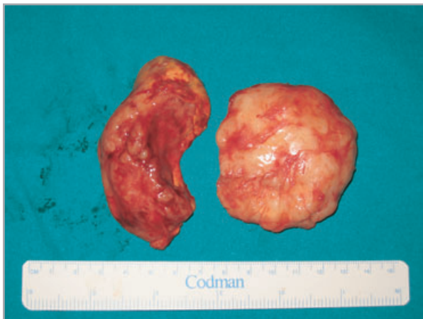
Fig 2. The mass was easily excised thanks to a well-defined cleavage plane. Macroscopically, it presented as a two yellow compact masses.