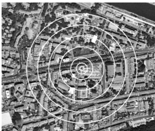
Fig. 2 - Circles of different size centred on sensor site (10 m, 25 m, 50 m, 100 m, 150 m, 200 m and 250 m radius)

For each site, GCR (percentage of green area of type L and T) was calculated on circle area of radius varying from 10m to 250m (Fig. 2). Lawn cover area (LCR) and tree cover area (TCR) were also computed applying separately the same procedure on green areas of type L and T.